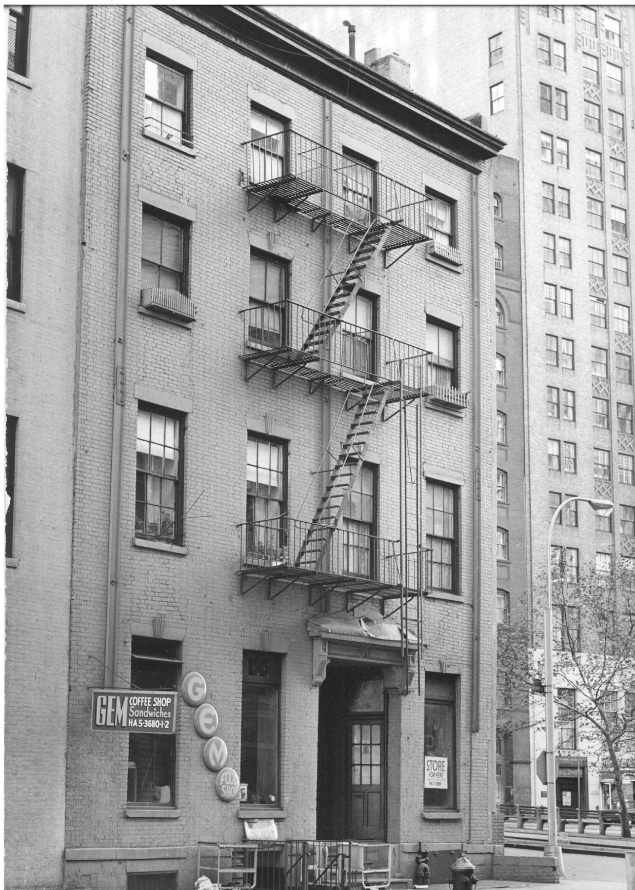
Robert and Anne Dickey House, front façade