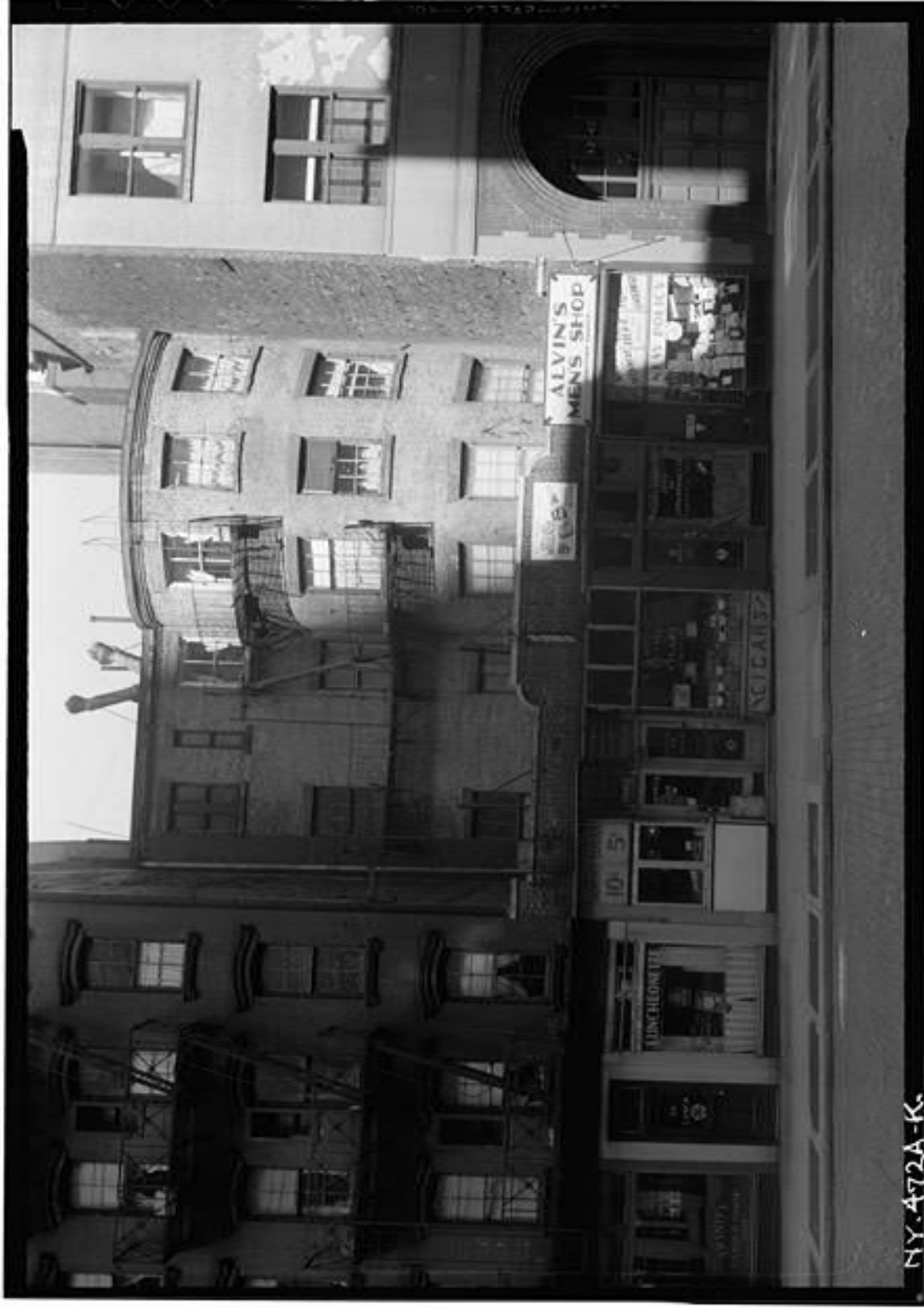
Robert and Anne Dickey House, 67 Greenwich Street, rear façade