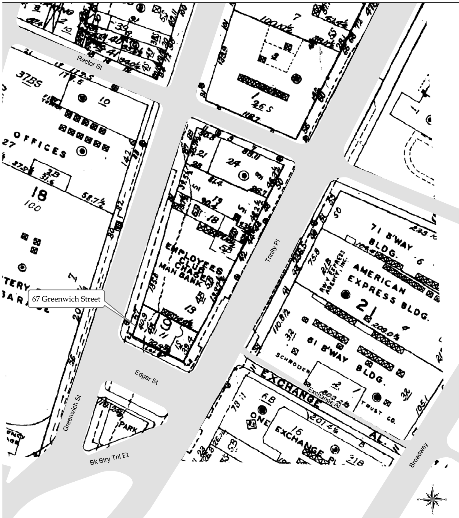
Robert & Anne Dickey House, 67 Greenwich Street (aka 28-30 Trinity Place), Manhattan Landmark Site: Borough of Manhattan Tax Map Block 19, Lot 11